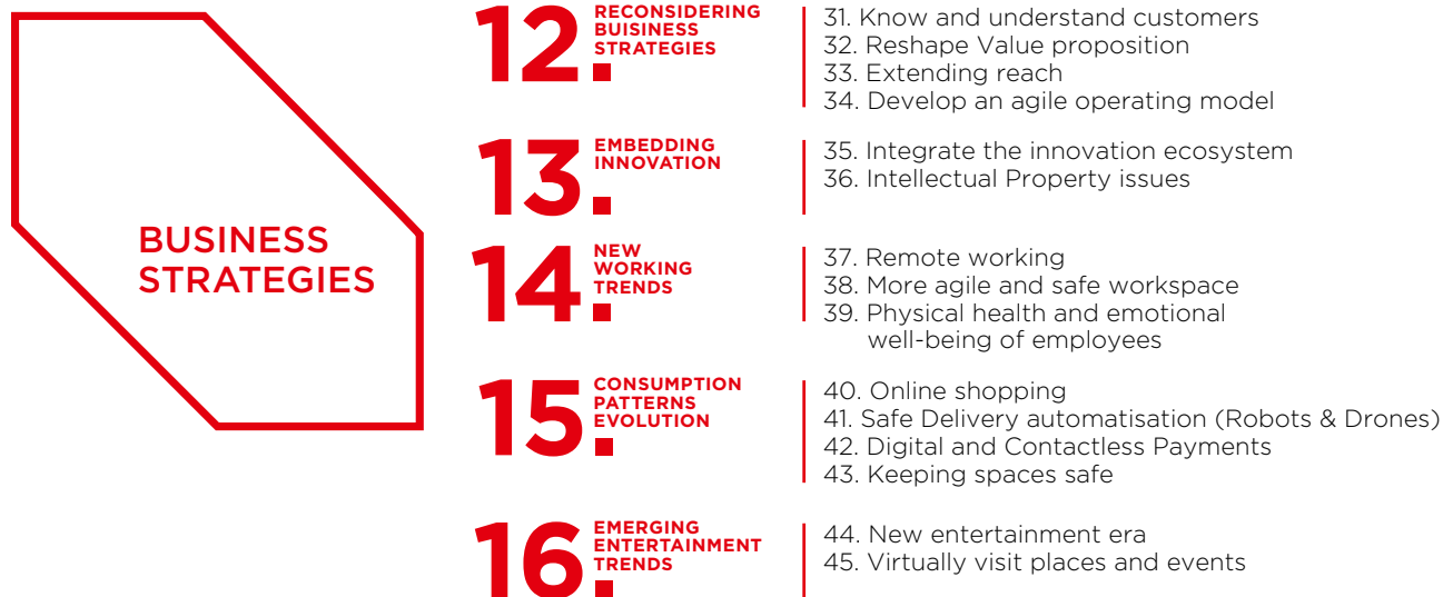
[Figure 6] - Main market trends impacting the post COVID-19 recovery related to Business Strategies

their business models, in particular (2) the changes in the consumption patterns, (3) the emergence of new forms of entertainment and tourism and (4) the importance taken by the remote working. Some technologies are emerging, exploiting the potential of digitalisation, while (5) embedding innovation will be a key differentiating factor (Figure 6)