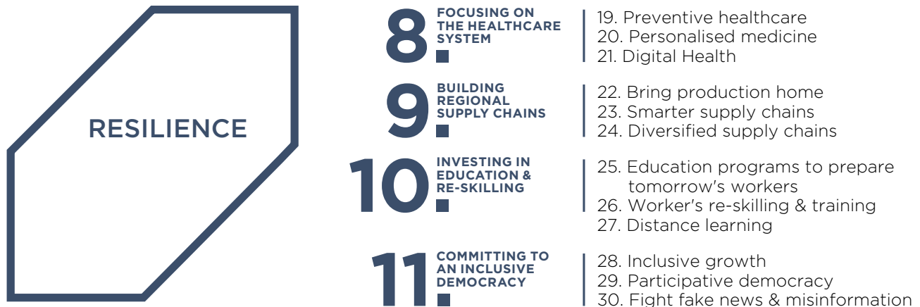
[Figure 5] - Main market trends impacting the post COVID-19 recovery related to Resilience

The COVID-19 crisis shows that resilience has much to do with (1) resilient supply chains, (2) the education and re-skilling of the workforce, (3) democracy and specifically with (4) a robust healthcare ecosystem (Figure 5).