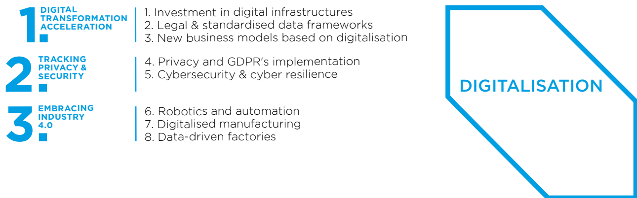
[Figure 3] - Main market trends impacting the post COVID-19 recovery related to Digitalisation

In synthesis, three main market trends have emerged from the COVID-19 crisis: (1) the accelerated adoption of digitalization in the economy and society, (2) the need to address security and privacy issues and (3) the opportunities related to Industry 4.0 [Figure 3].